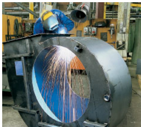
Illustration 2: YORK Novenco develops and produces air handling systems and equipment that are marketed and distributed worldwide.