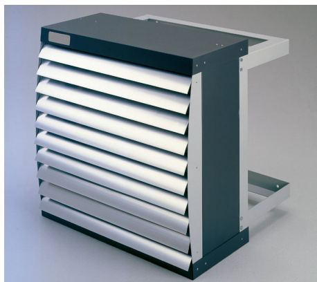
Illustration 1: NoVa® air heater.

By combining configuration, dimensioning, and calculation in this way, YORK Novenco has developed a powerful tool for individual customization of air heaters.